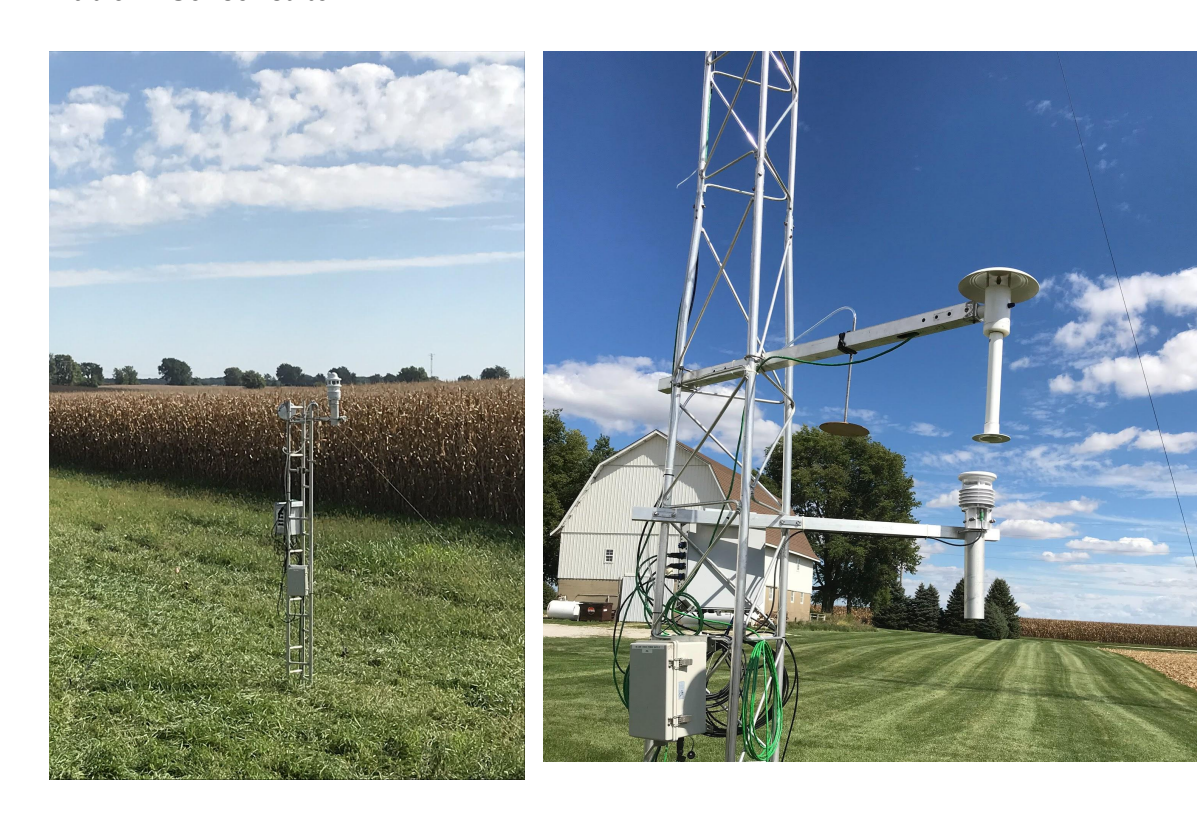
Figure 2: (left) Vaisala PTB. (right) ISFS Temp/RH sensor (top) and Lufft WS300 (bottom).