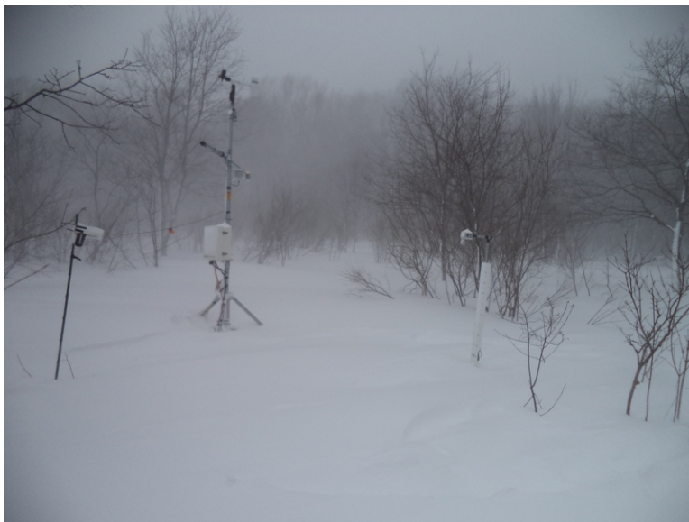
Similar view of the snow study station but on January 7, 2014 (above). Note how much less brush there is even though the total snow depth is only \sim \frac{1}{2} m.