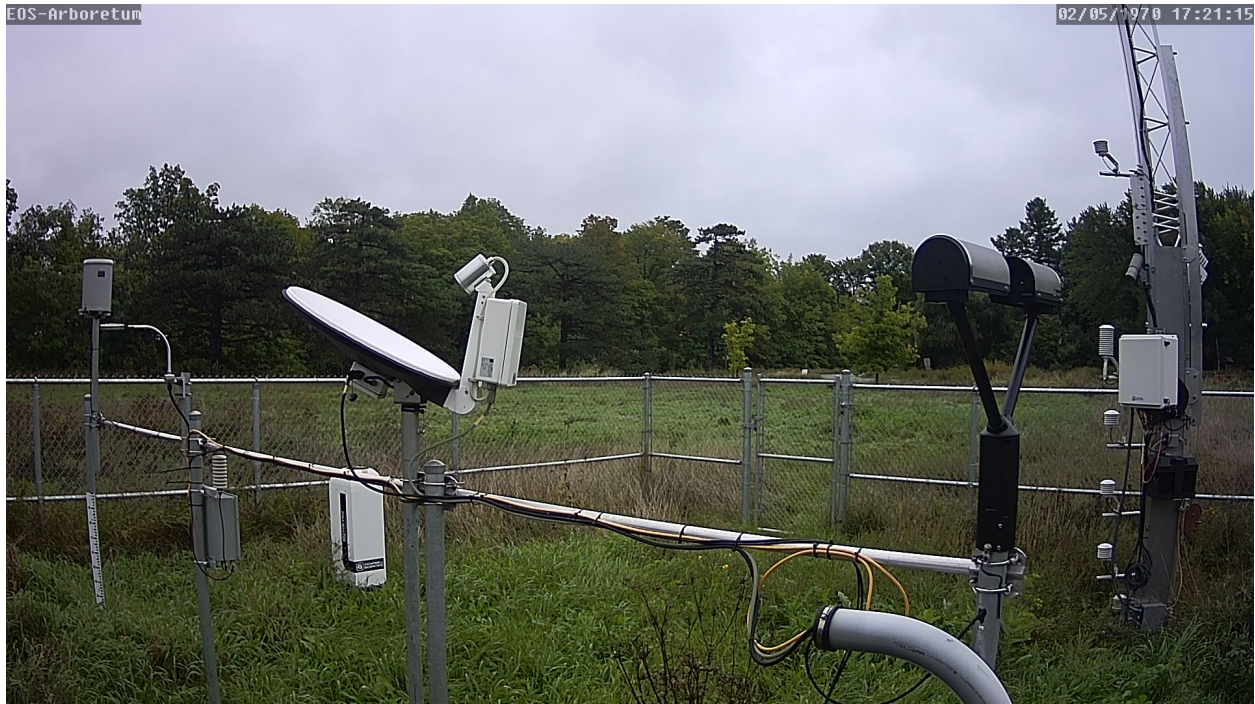
Fig. 1. Illustration of the MRR-2 at the Arboretum sentinel.